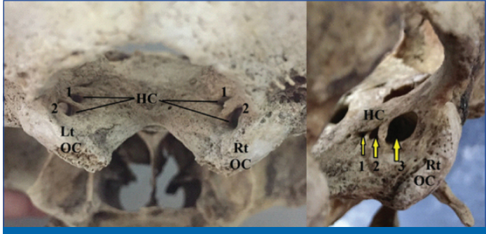
[Table/Fig-3]: Shows double Hypoglossal canal (HC) and Tripartite (3 canals) HC.1, 2, 3-no. of canals.