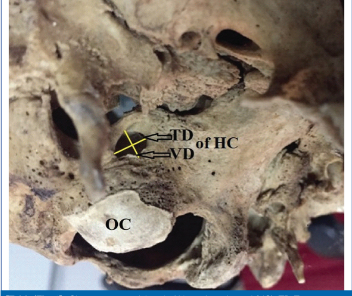
[Table/Fig-1]: Shows extracranial end of Hypoglossal canal (HC). TD-Transverse diameter, VD-Vertical diameter OC-Occipital condyle.